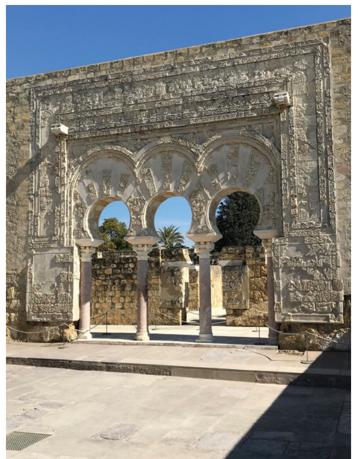
Medina Azahara Córdoba