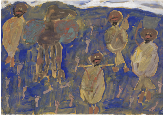
Fig. 1: Jean Dubuffet, Four Bedouins with an Overloaded Camel , 1948. The Museum of Modern Art, New York City. ©2017 Artist Rights Society (ARS), New York/ADAGP, Paris.

natural surroundings, they were thought to exhibit uninhibited behaviour, charming in its simplicity.