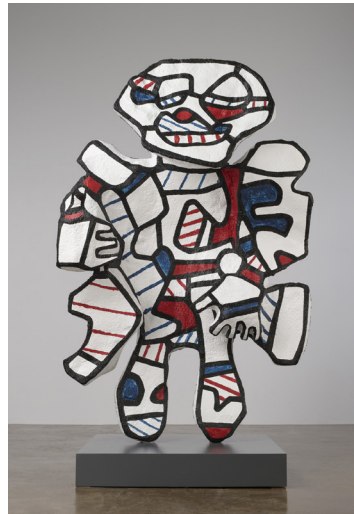
Fig. 5: Jean Dubuffet, Personnage pour Washington Parade, 1973-2008, Edition 5 of 7. No. 46497.05