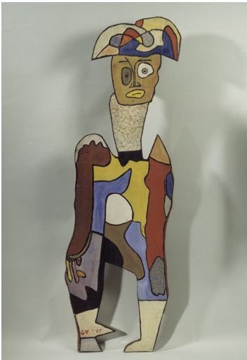
Fig. 4: Gaston Chaissac, Totem Double Face , 1961. Photo: Centre Pompidou, MNAM-CCI, Dist. RMN-Grand Palais / image Centre Pompidou, MNAM-CCI. © 2017 Artist Rights Society (ARS), New York/ADAGP, Paris.

Gaston Chaissac, an artist, writer, and shoe-repairman whom Dubuffet met during his time in Algeria, is a case in point. Quickly admitted to the Art Brut collection, he would later prove difficult when he began to strive for additional artistic acknowledgement. After becoming aware of similarities between his art and Dubuffet's current projects, Chaissac famously accused Dubuffet of plagiarism. A most convincing comparison ( Figures 2 & 3 ) exists between one of Chaissac's untitled charcoal sculptures, still in Dubuffet's Lausanne collection, and Dubuffet's Cursed Gossip —carved six years later from the same crude charcoal material—or between Chaissac's 1961 Totem Double Face and Dubuffet's 1973 Personnage pour Washington Parade ( Figures 4 & 5 ).