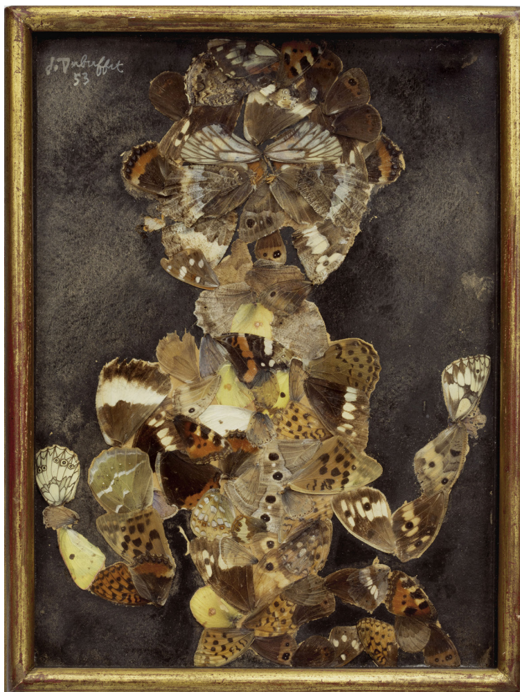
Fig.7: Jean Dubuffet, Butterfly-Wing Figure , 1953. Hirshhorn Museum and Sculpture Garden, Smithsonian Institution, Washington, DC, Joseph H. Hirshhorn Purchase Fund, 1991. © 2017 Artist Rights Society (ARS), New York/ADAGP, Paris.