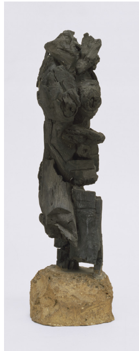
Fig.3: Jean Dubuffet, Cursed Gossip , 1954. The Museum of Modern Art, New York City. © 2017 Artist Rights Society (ARS), New York/ADAGP, Paris.