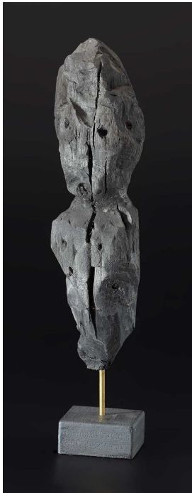
Fig.2: Gaston Chaissac, Untitled , c.1948.

oneself in the same way others go fishing or for walks and not to put in a show' (qtd. in Peiry 164). In other words, it should be a recreational activity as opposed to a profession. So, it follows that '[y]ou have to choose between making art and being regarded as an artist. The one excludes the other' (qtd. in Peiry 163). With this claim, Dubuffet excluded any outsider artist who might regard him or herself as an artist sans the outsider prefix. Some of Dubuffet's Art Brut artists adhered to these guidelines, having total disregard for the art object after its completion, but others maintained a more traditional relationship to their artworks, expressing feelings of pride and/or a desire for compensation.