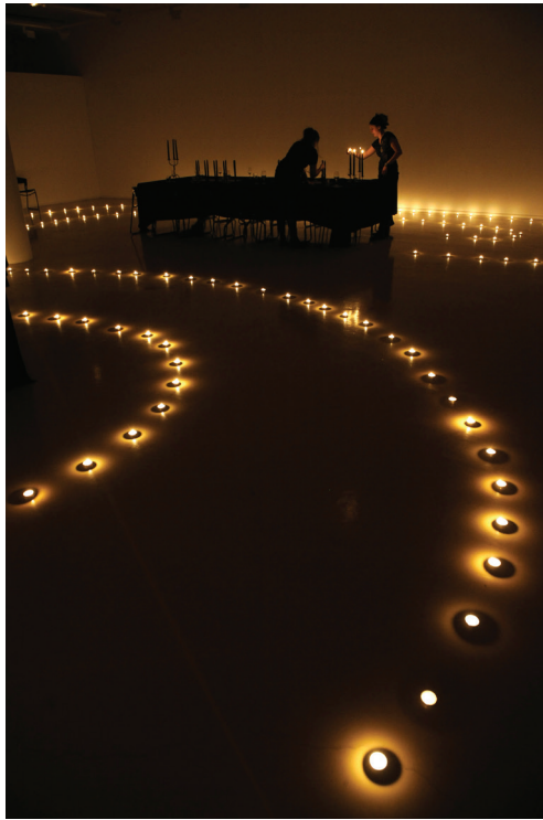
Fig. 4. Emmanuel Giraud, Devenir gris , 2009.

of a well-chosen group of table guests' (11, my own translation from the French).