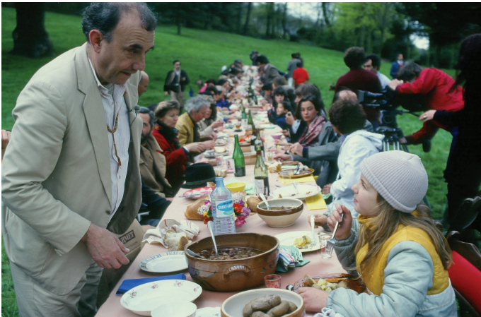
Fig. 1. ‘Daniel Spoerri (standing on the left) during Le déjeuner sous l’herbe , 1983’. 12 February 2018.

Drawing on performance theory, I will stress how commensality and the sociability of the table offer the possibility of active audience participation. These elements, together with the banqueters’ performative involvement, have constituted the basic components of the banquet in history. It should, therefore, be productive to explore how these components are being rediscovered and reproduced in contemporary banquet performances.