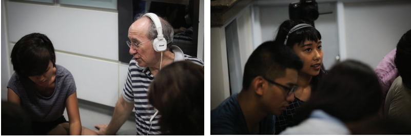
Fig. 5 and 6: Surrogate Speakers, Singapore, image courtesy of Sam Chow.

conveying and transmitting an authored, ‘source’ narrative: