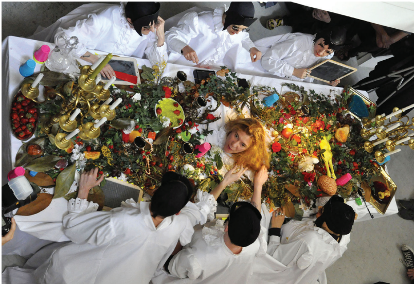
Fig. 6. La Banquette des Platonnes , 2016. Photographer: Hubert Karaly.

and her philosophical discourse is ‘ingested’ by the other female symposiasts. Precarious food (rotten fruit, candies, and marshmallows) and wine are offered only to female spectators. Male spectators cannot enjoy this oral experience, since their mouths are stuffed with sanitary towels. As Nariné Karslyan, who is part of Les Platonnes, told me, the aim was to achieve a state where the men can, for once, remain silent and listen to the philosophical discourses pronounced. 15 The participants in this banquet performance thus communicate a clear political message against the diachronic male supremacy, during which women’s mouths were shut for centuries. Women were not allowed to express their own version of important philosophical issues. Similarly, they could not easily indulge themselves with the sensual pleasures (love, wine, and food) that had been normally reserved for men. 16