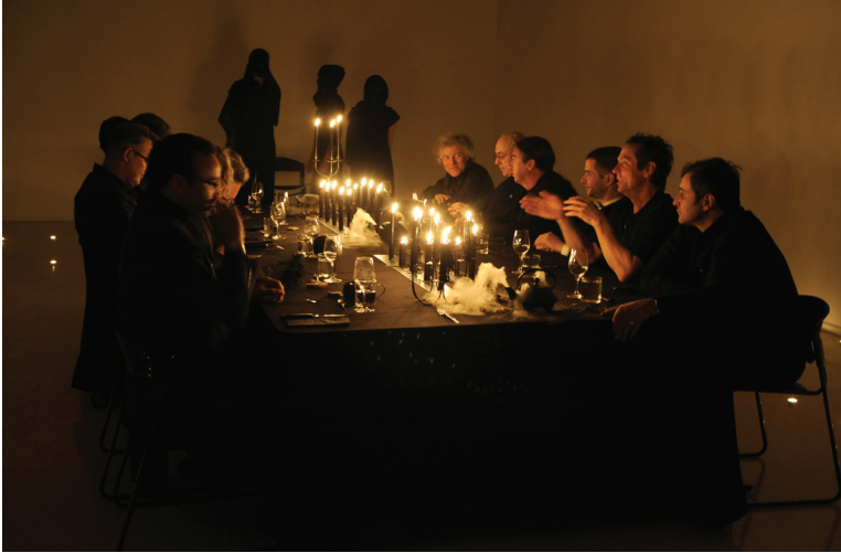
Fig. 5. Emmanuel Giraud, Devenir gris , 2009. Photographers: © Luc Jennepin / Emmanuel Giraud. Courtesy of the artist.

black egg, raddles of rare rabbit in cocoa juice, and Guinea fowl in tombstone, among other morbid delicacies. This dark, highly aestheticised scenography of vision and taste is dramatically eloquent: the banquet's menu and recipes, just like the props 12 , tell a story of mystery and death and approach this topic with black humour.