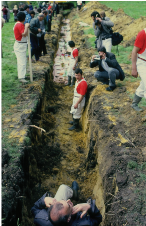
Fig. 2. 'The tables are installed inside the trench. Daniel Spoerri, in the foreground, is directing the operations'. Daniel Spoerri, Le déjeuner sous l'herbe , 1983. 12 February 2018.

actions'. One of them that I will briefly present is Déjeuner sous l'herbe ( Luncheon under the grass ), 9 whose title is a reverse reading to Manet's famous painting Déjeuner sur l'herbe (1863). In the outdoor area of a château, Spoerri set a long table for a hundred guests, while a forty meter-long trench was being dug. In the middle of this feast, Spoerri ordered the diners to bury the tables with the food leftovers inside the trench. In 2010 and 2016, in a type of archaeological excavation, the banquet's leftovers were revealed once again, in a gesture to remind