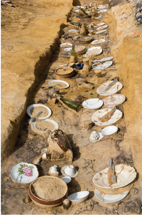
Fig. 3. 'The excavations of part of the banquet in 2016.' Daniel Spoerri, Le déjeuner sous l'herbe , 1983/2016. 12 February 2018.

later, a symbolic resurrection of the meal would take place. The banquet's decaying (s)cenography would acquire the characteristics of an archaeological find, a relic of a performance that lasted a lot longer than usual. Indeed, this performance might be thought of as having continued under the ground for decades after the meal was over. Spoerri thus played with the notion of time, which can be both devouring and disgorging.