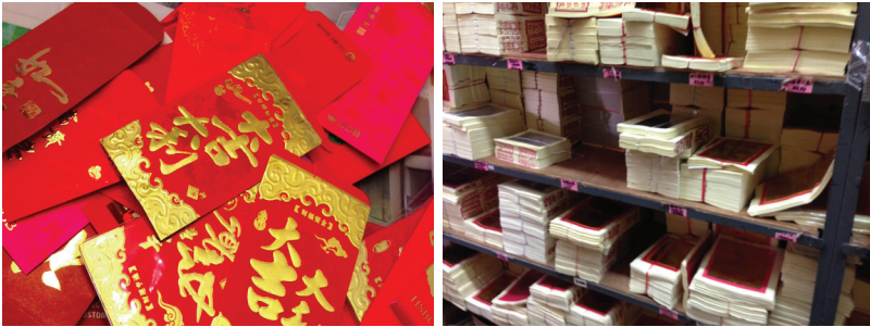
Fig. 1 and 2: Left, red packets or 红包; on right, joss paper or 金纸, Singapore, image courtesy of the artist.

Participants in one of the circles rather enthusiastically