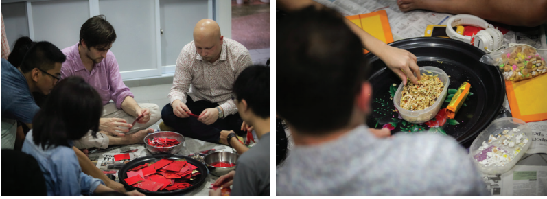
Fig. 3 and 4: Left, a group working on opening red packets; on right, a group crafting and filling tubes of joss paper, Singapore, image courtesy of Sam Chow.

icing dust with dried shredded cabbage, and orange peel to create a filling which participants spooned into rolled tubes, tucking the ends neatly to contain this (Figure 4). Once this task was completed, I took the filled, prepared rolls and placed these on a gas-flamed barbecue grill outside where they were reduced, fragrantly, to ash. This was sprinkled on the meatballs as garnish to the dish.